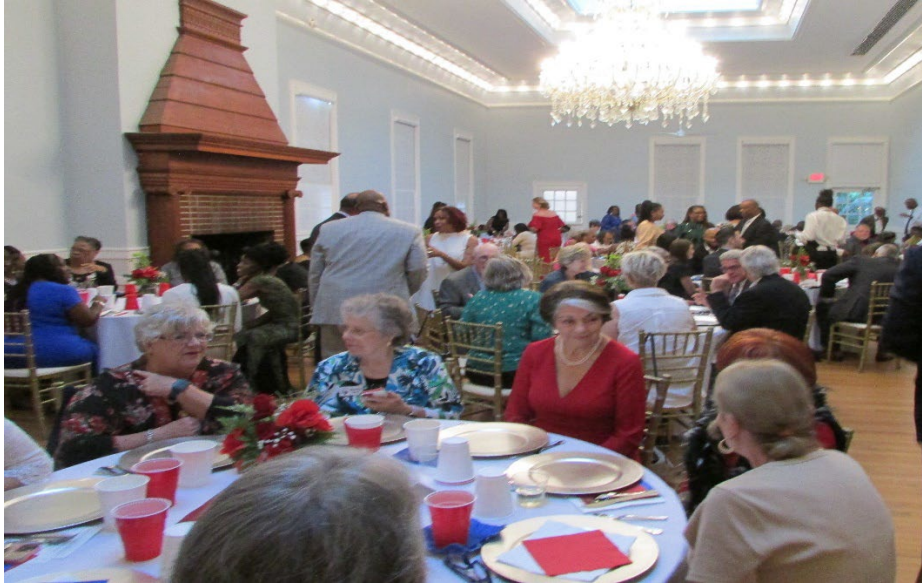
Beautiful room at Ashton Villa