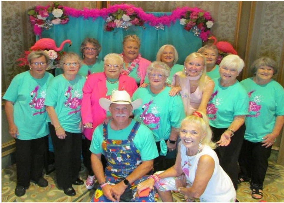
Galveston Republican Women supporting Bra Dazzle