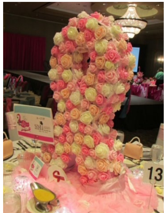
Winning Table Center Piece