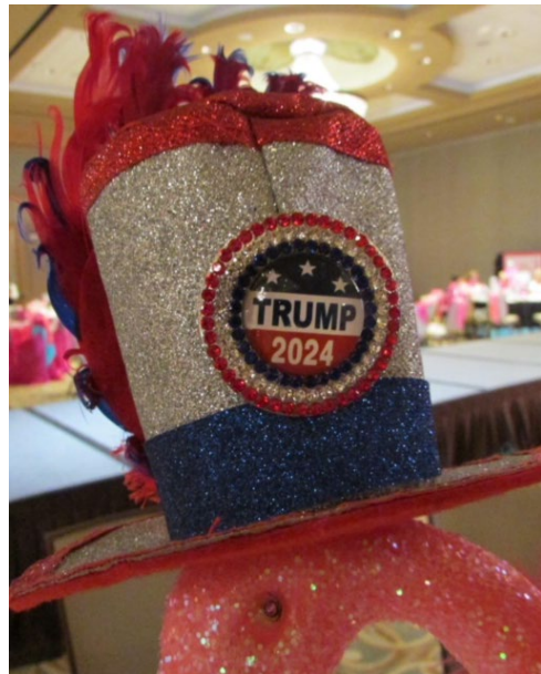
Another Center Piece Check out the Flamingo's Awesome Hat