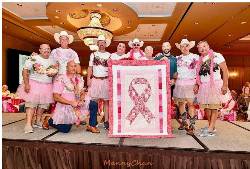
MannyChan

Texas Public Policy Foundation: www.texaspolicy.co