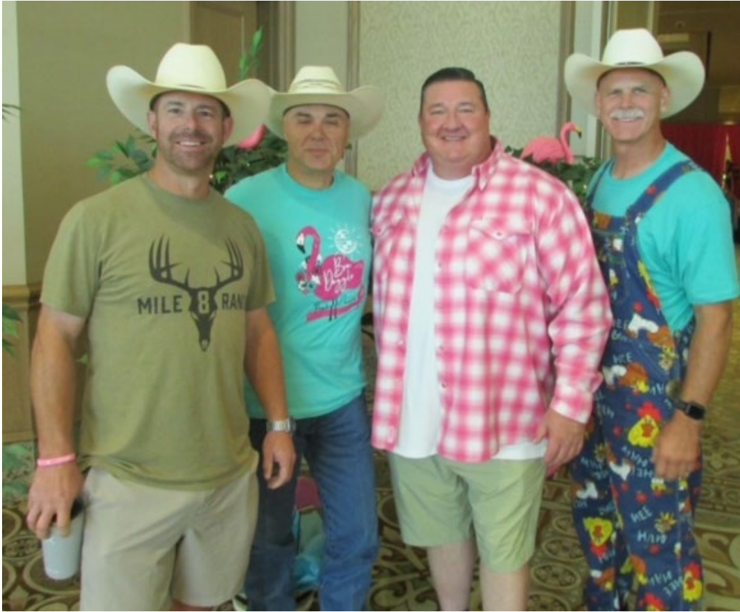
Models of Bra Dazzle