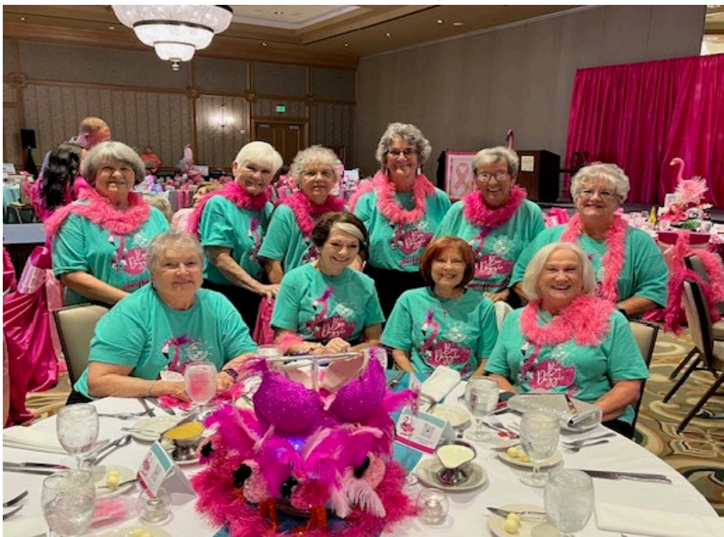
Galveston Republican Women Attending BRA DAZZLE To support Breast cancer Awareness

that is down from a 10-point lead among Hispanics in 2020. According to the group, Trump received just 6 percent of the black vote in 2020. Now, his support is at 17 percent. The polling data found that Harris has a 44 percent favorable rating among Texas voters compared to 54 percent unfavorable. In contrast, Trump has 51 percent favorable to 48 percent unfavorable. Border policies rank high with Hispanic voters. When asked in April about increasing deportations of people who are already in the country illegally, 56 percent of Hispanics supported the idea compared to 34 percent in opposition. Similarly, 60 percent of Hispanics polled support penalizing businesses that hire illegal aliens. Written by Daniel Greer and can be read in its entirety in Texas Minute , Wednesday, Sept. 25, 2024.