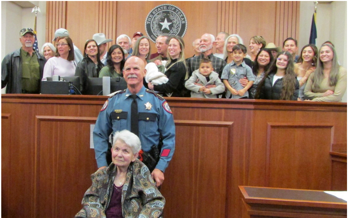
The Fullen Family